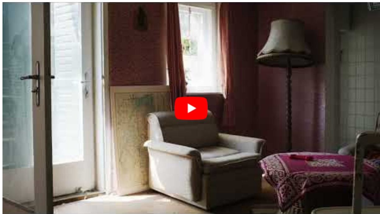
Endless Wellness - "Kinder"