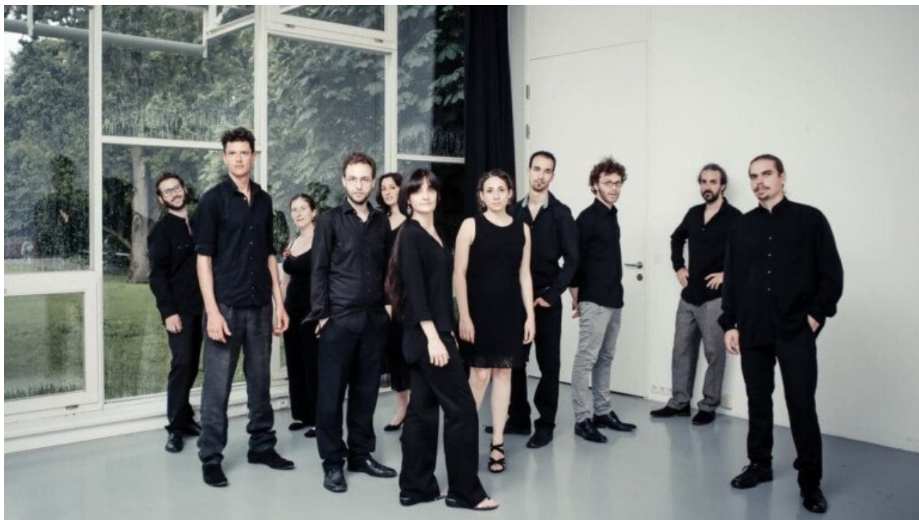
Schallfeld Ensemble

July 22, 2023 / classical music, contemporary music, festivals, news