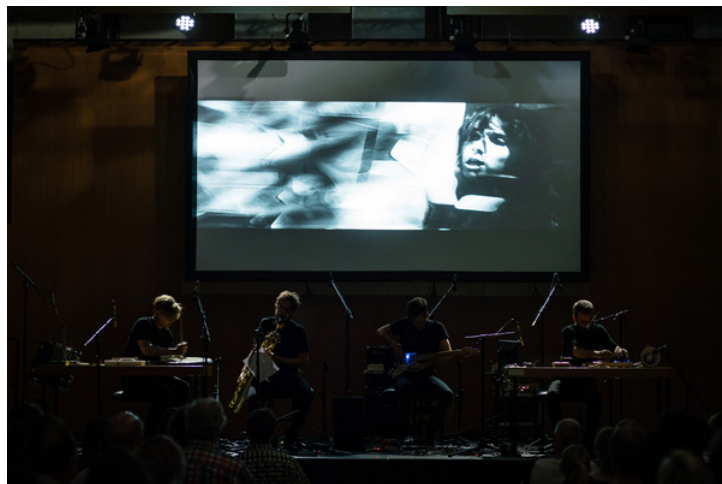
Ensemble Nikel