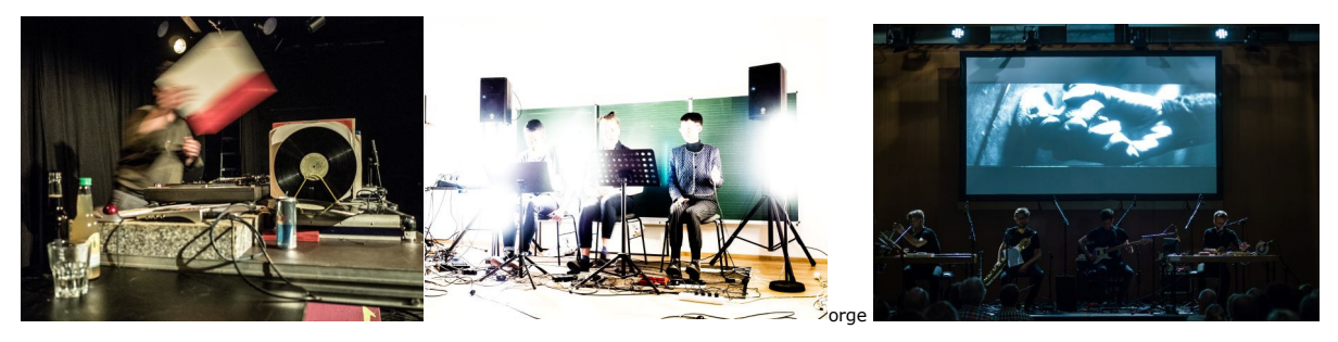
Jorge Sánchez-Chiong / impuls participants / Ensemble Nikel_Film by Peter Tscherkassky at various performances

* Premières, most recent contemporary compositions – amongst others also impuls commissions – as well as compositions of the 20th century at various concerts with works by more than 186 composers . In total 111 world premieres plus 7 Austrian first nights ; altogether 288 works including 9 improvisations were performed in public.