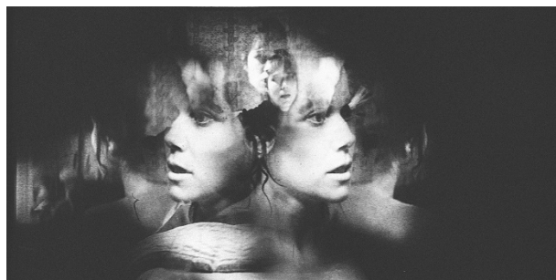
Ensemble Schallfeld + Outer Space/Peter Tscherkassky

Check out all Ulysses network projects at >>> http://project.ulysses-network.eu/