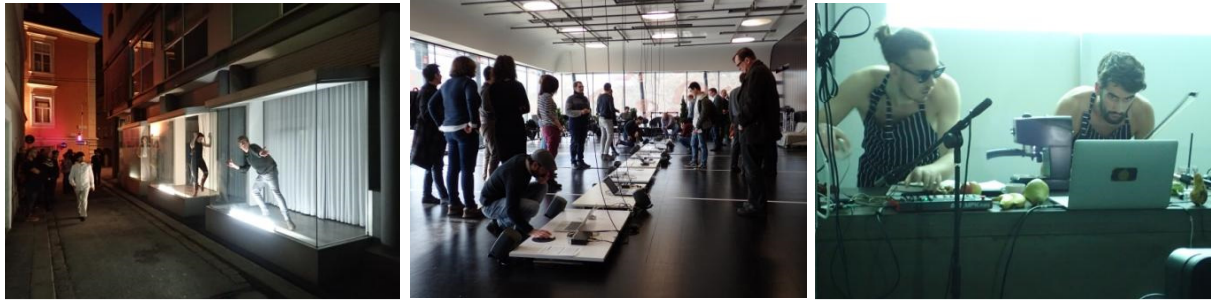
Collaboratory + ALMAT + Collaboratory

The Academy offers could once more be enlarged (with 35 tutors for composition and instrumental classes as well as several conductors and other lecturers, with daily classes also for electronics, improvisation, yoga and intermedia projects, ..., and last but not least a special focus put on the topic film + music). Also various new special programs (ALMAT, Collaboratory, Trio Accanto, Double bass in Dialogue, Love Songs and Accordion Special just to name a few) were offered and the cooperation in between composer and interpreter intensified once more, for example through various calls for score, reading sessions and compositions developed and finalised together with musicians on spot.