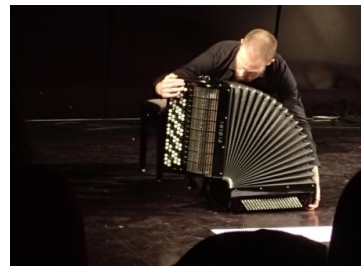
Sax-Solo + Sax-Ensemble + Accordion Special

235 regular Academy participants (80 male and 35 female composers, 61 male and 59 female musicians), 13 invited composers plus 11 more external participants coming from 4 continents and 51 nations were accepted to the 10th International Ensemble and Composers Academy for Contemporary Music in 2017 (10.-21.2.2017, Graz, Austria).