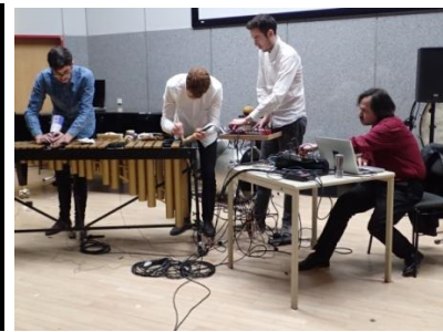
MarathonConcerts with Performance + Video + Electronics ...

* With performances and installation pieces and concerts placed at various galleries and art institutions in Graz as well as a focus on experimental film + music impuls also enforced the link of music and the visual arts.