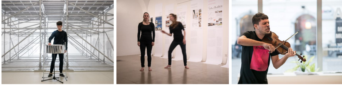
impuls MinuteConcerts at various venues_Fotos: Arnold Haberl

* Premières, most recent contemporary compositions – amongst others also impuls commissions – as well as compositions of the 20th century at various concerts with works by more than 186 composers