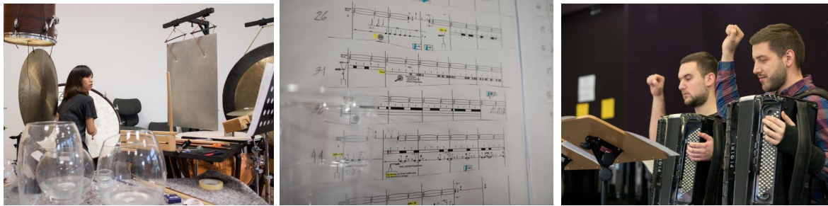
impuls participants at rehearsals / score