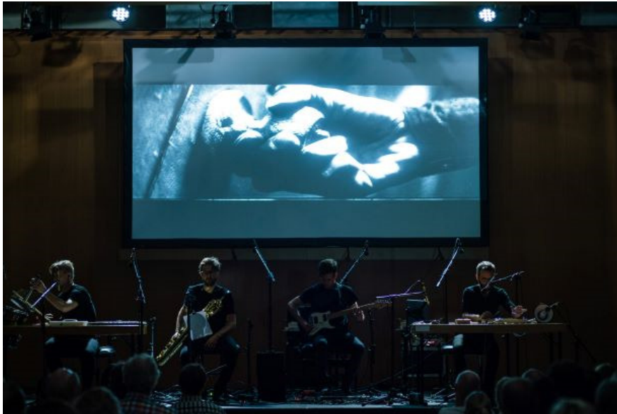
Ensemble Nikel_Film by Peter Tscherkassky

ALMAT, CinemaScope Music with Ensemble Nikel and experimental films by Peter Tscherkassky and concerts placed at various galleries and art institutions in Graz impuls also enforced the link of music and the visual arts .