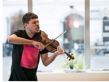
impuls MinuteConcerts at various venues

* Premières, most recent contemporary compositions – amongst others also impuls commissions – as well as compositions of the 20th century at various concerts with works by more than 186 composers